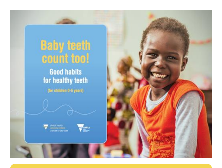
Participants can complete the workshop online in their own time.

With program funding having concluded year, June 30 this we transitioned the program to sustainable model of delivery which will enable us to continue offering the workshop to any interested supported playgroup facilitators. Free electronic resources for facilitators, playgroups available for and families will be download at the conclusion of the training - so it's not too late.