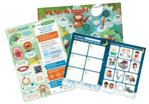
Brush Book Bed electronic resources for families

Last issue we brought to you an online version of our Brush Book Bed workshop for supported playgroup facilitators which aims to help reduce tooth decay in young children (birth to age 5). We are thrilled to have received such great interest from supported playgroup facilitators who want to better support their families with toothbrushing and dental health!