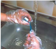
Backward bent toothbrush