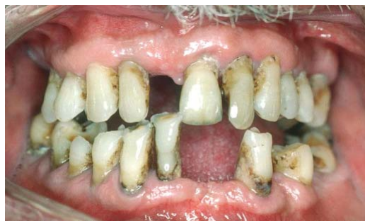
Advanced Periodontitis (Gum Disease)

Advanced gum disease is a condition that is more common and severe in adults particularly as they age. It is caused by certain bacteria that build-up in the deeper layers of thick dental plaque situated along the gum line of teeth. These bacteria produce toxins that seep between the gum and the tooth, irritating the gum tissue and causing it to become reddened, inflamed and bleed. If the plaque is not cleaned away the toxins may gradually destroy the fibres and bone that hold teeth in place. This eventually leads to the loosening of teeth.