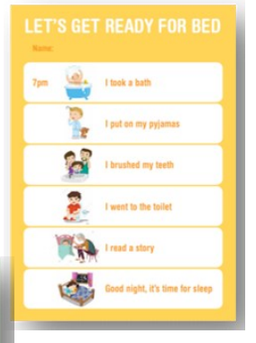
Brush, Book Red resources