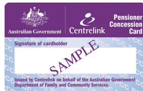
Pensioner Concession Card (Kaadhka lacag dhimista ee Hawlgabka)